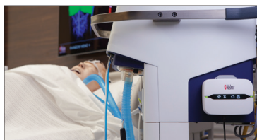
Fan-less design for use in operating rooms and ICUs