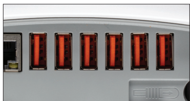
Multiple USB ports for up to six medical devices