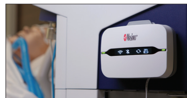
Versatile mounting options